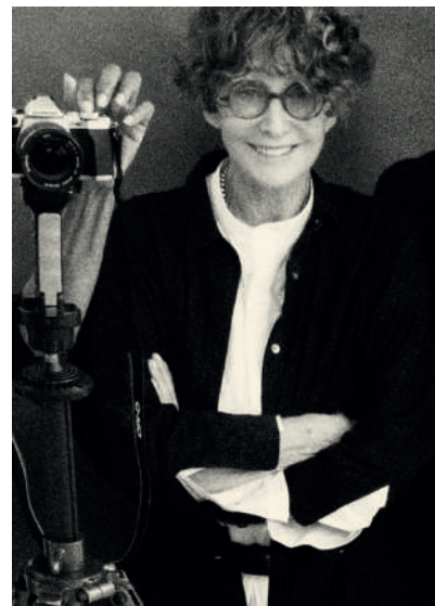
Self-portrait

She has also directed several feature and medium-length films on photography and photographers. Sarah Moon has received numerous awards for her work and has been exhibited and recognized throughout the world. In 2021, the Museum of Modern Art in Paris presented "PasséPrésent" a retrospective of her work.