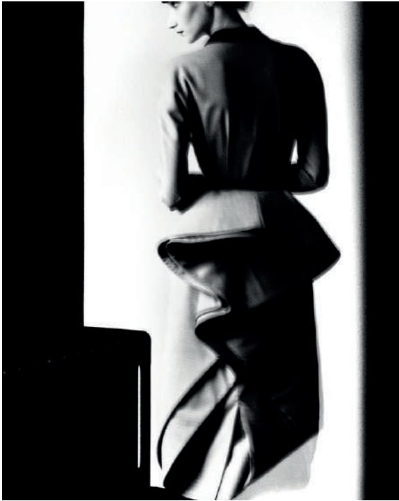
Cocotte, Christian Dior Afternoon dress, Spring/Summer 1948