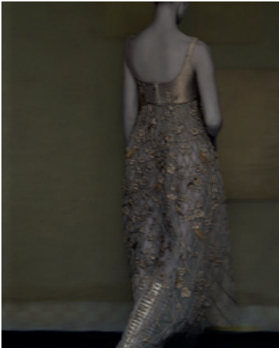
Numéro 352, Maria Grazia Chiuri for Christian Dior Miss Dior dress, Spring/Summer 2021