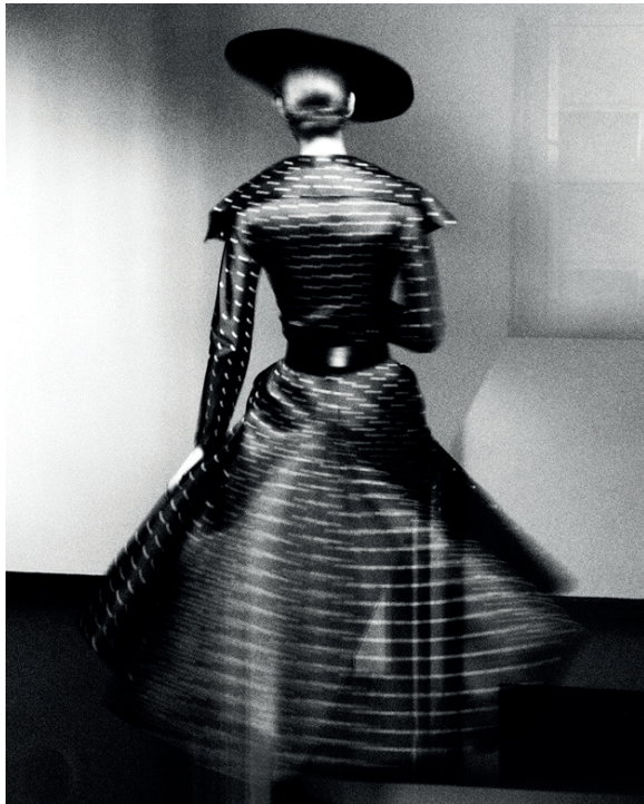
Papillon, Christian Dior Afternoon dress, Spring/Summer 1948