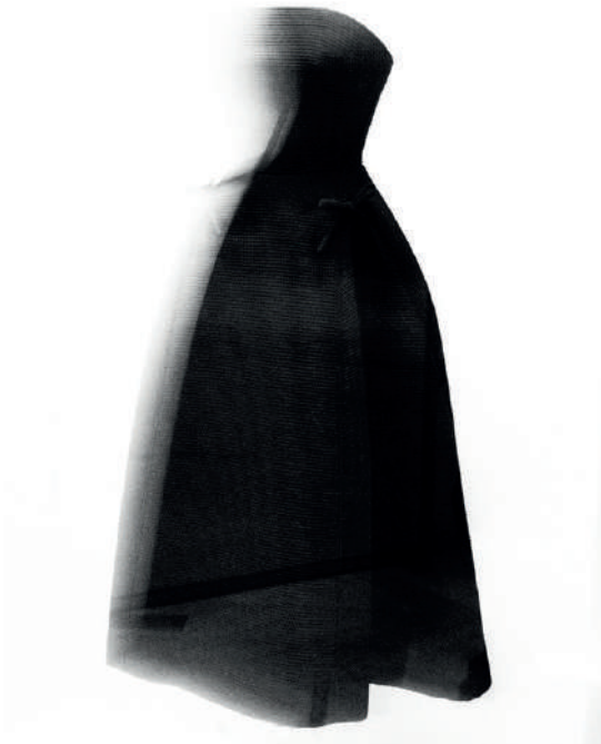
Sonnet, Christian Dior Ball gown, Autumn/Winter 1952