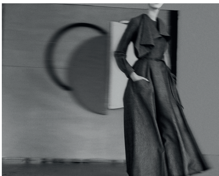
Sans atout, Maria Grazia Chiuri for Christian Dior Coat dress, Autumn/Winter 2017