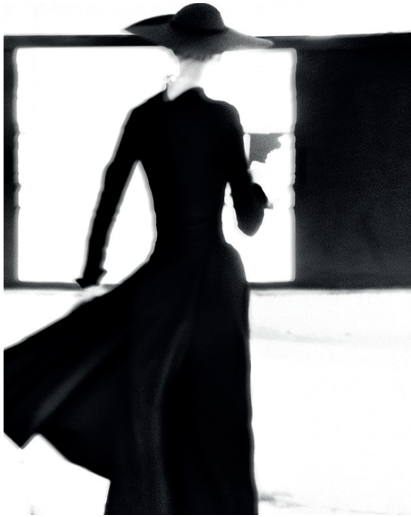
Drags, Christian Dior Afternoon dress, Spring/Summer 1948