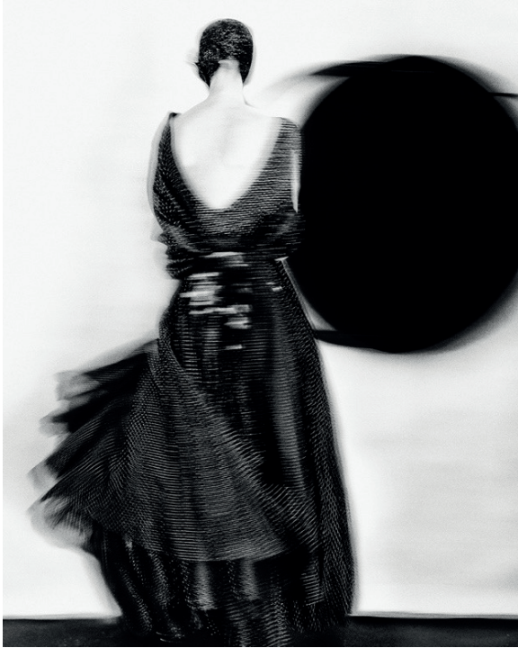
Gianfranco Ferré for Christian Dior Evening gown, Autumn/Winter 1989