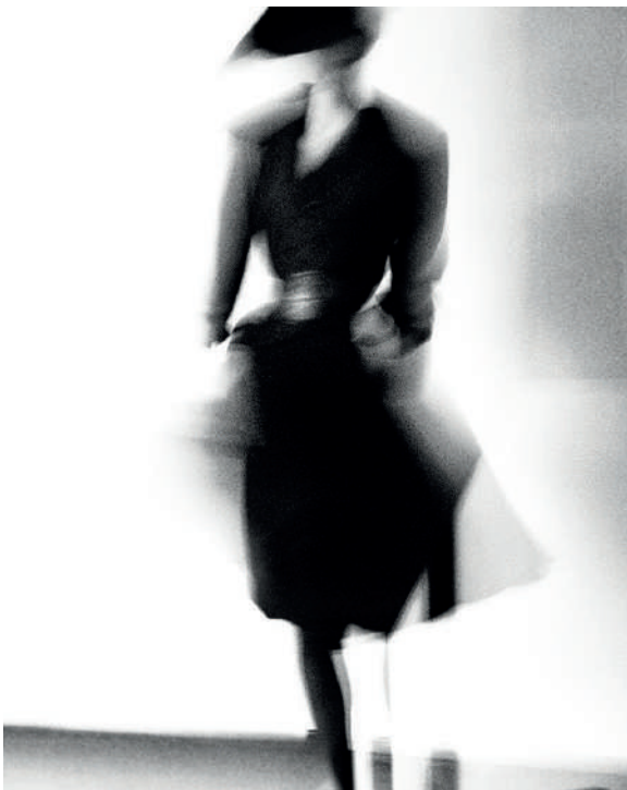
Miss Dior, Christian Dior Afternoon dress, Spring/Summer 1949