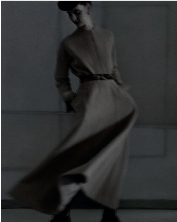
Sahara, Maria Grazia Chiuri for Christian Dior Coat dress, Autumn/Winter 2017