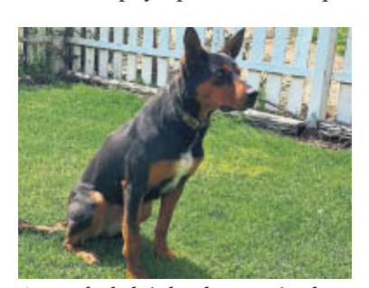
▲ Eve the kelpie has been trained to work with cattle, sheep and goats

ability to work with cattle, sheep and goats helped to attract potential buyers.