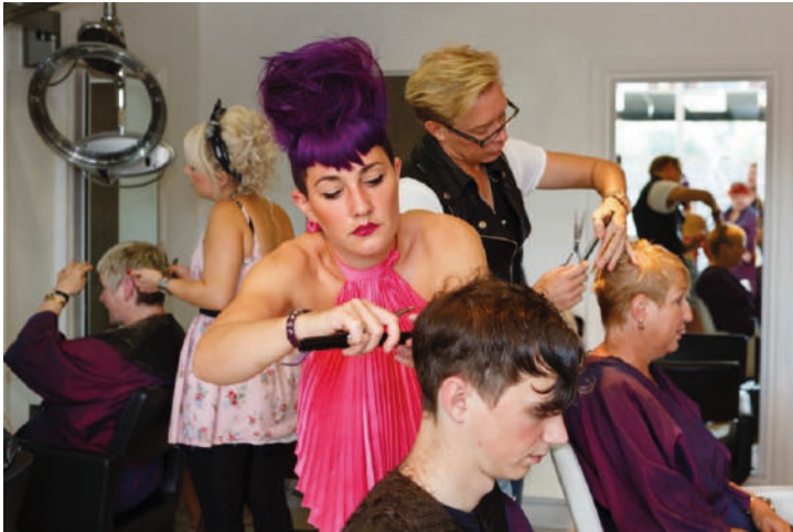
Martin Parr, Hair salon, Wolverhampton, 2012