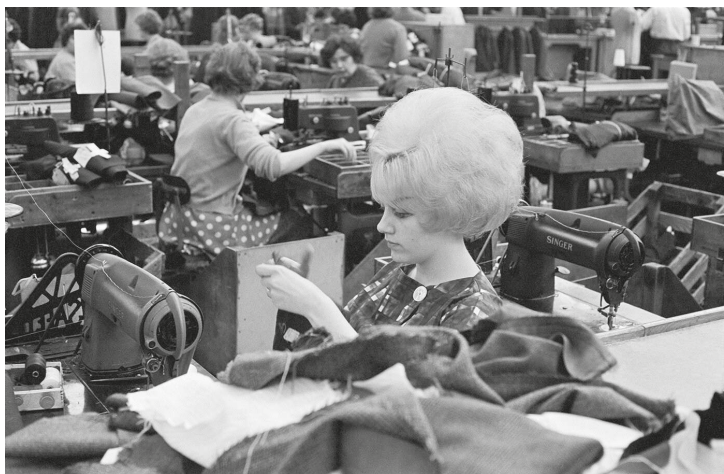
Henri Cartier-Bresson, Atelier de confection, Manchester, Royaume-Uni, 1962