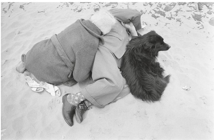
Henri Cartier-Bresson, Blackpool, juillet 1962