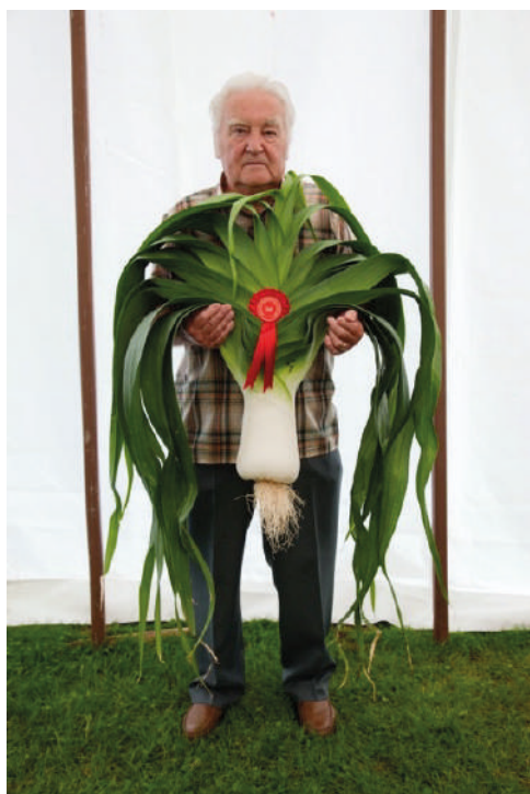
Martin Parr, Best Pot Leek, Sandwell Show, 2010