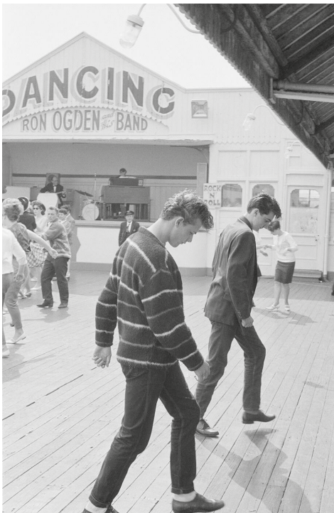
Henri Cartier-Bresson, Blackpool, juillet 1962