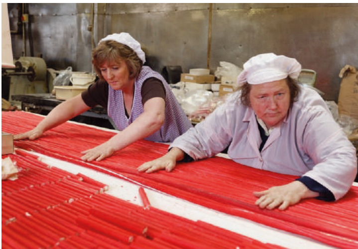
Martin Parr, Sweet Factory, Dudley, 2010