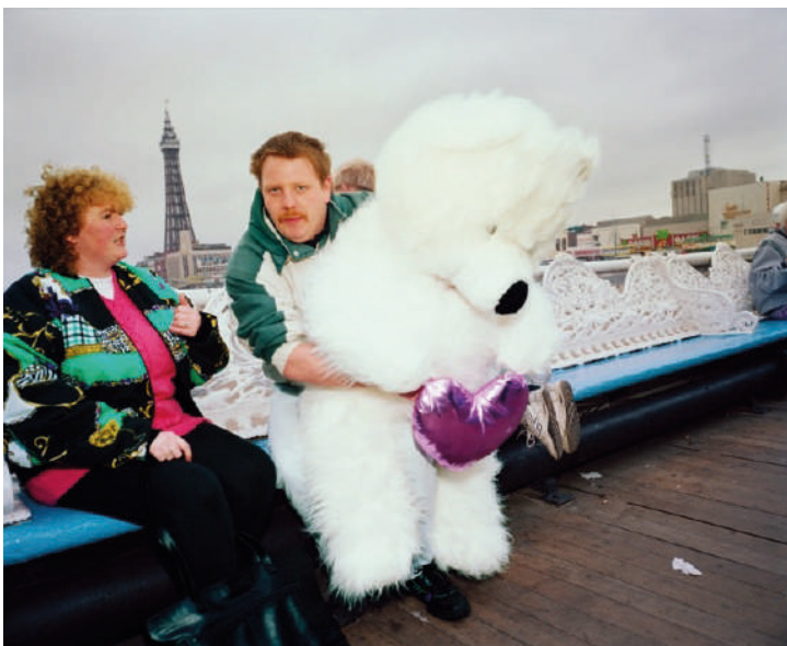
Martin Parr, Blackpool, 1993 © Martin Parr / Magnum Photos