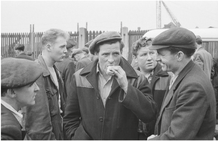
Henri Cartier-Bresson, Liverpool, octobre 1962 © Fondation Henri Cartier- Bresson / Magnum Photos