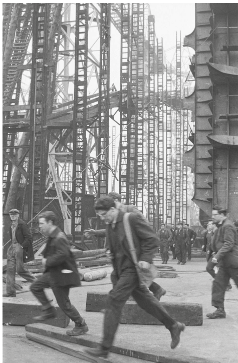
Henri Cartier-Bresson, Liverpool, octobre 1962 © Fondation Henri Cartier- Bresson / Magnum Photos

Only three of these photographs (excluding the cover of the book) can be published at the same time by the same medium in the same issue.