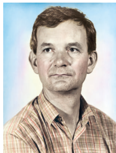
Havana, Cuba, 2000