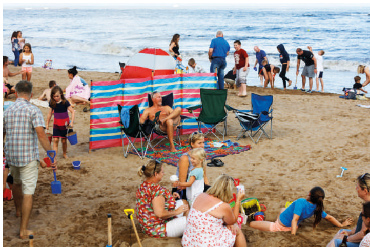
Martin Parr, Scarborough, 2016